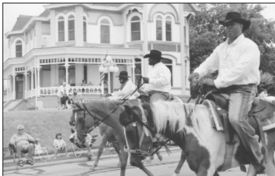
Belton . . . believed to have the nation's oldest July 4th parade, first recorded in 1852, presented annually since 1979