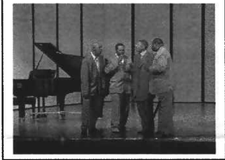
The Gospel Holy Tones