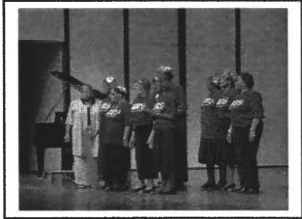
The Friendship House Choir