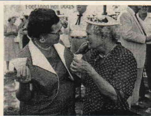
Russell Lee, Ladies talking together at Fourth of July celebration, Belton, Texas, 1956.

Russell Lee: The Man Who Made America's Portrait opens Saturday, September 17, 2005, at both the museum (1:00 p.m.) and at Temple College's Visual Arts Gallery (2:30 p.m.). The joint exhibition, on loan from the Witliff Gallery of Southwestern and Mexican Photography , examines the photojournalistic work of one of the most prolific American photographers of the twentieth century. Lee (1903-1986) is well known for his photography from 1936 to 1942, working for the Farm Security Administration (FSA), a New Deal program designed to assist rural communities during the Great Depression. Of the many photographers employed by the FSA, Lee created perhaps the largest body of work, about 30 percent of approximately 164,000 images. Lee's career spans four decades. His work captured America from the wheat fields to industrial sites as well as everyday life. He worked extensively in Texas and taught at the University of Texas for eight years before retiring in 1973.