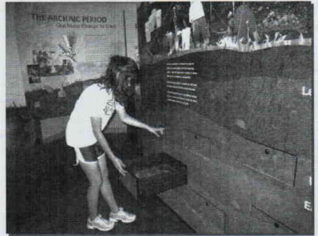
A youngster discovering Clovis secrets